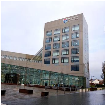
Figure 2: The Urban Sciences Building at Newcastle University. A Living Lab building designed to the BREEAM Excellent standard.

physical attributes of that space and in examining the role building data might have in negotiations of its use.