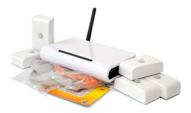
Fig. 1. BuildAX Environmental Sensor Toolkit: including logger, sensor nodes and supplied cables

The sensor toolkits distributed to FMs and students consisted of a base unit logger (see Fig. 1) which receives data from sensor nodes with a range of approximately 100m line-of-sight and logs this to memory (SD card), with optional network access. The sensor nodes incorporate factory-calibrated temperature, humidity, light, passive infrared (PIR), and magnetic reed switch sensors<sup>2</sup>. The sensors were configured to broadcast data packets at a resolution of 30 seconds, or 120 samples per hour, to allow analysis in tools such as Microsoft Excel which